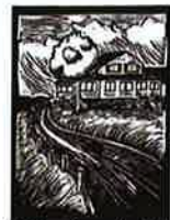
Michael's on the Hill