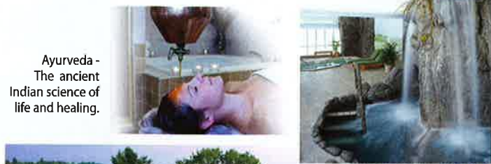
Ayurveda - The ancient Indian science of life and healing.

The spa promotes the essence of life and longevity through its wellness programs using indigenous, therapeutic products; anti-aging remedies and non-invasive treatments. With an emphasis on providing services that are custom based upon the needs of the individual, the specialty of their programs is to allow the body to assist healing. The Spa's mountain inspired design with cascading waterfalls, meditative gardens and soothing soaking pools melt the stresses of every day life away. Lavish yourself in relaxation. stoweflake.com