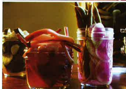
Pickled Vegetables & Dilly Bean Infused Vodka - used for our Bloody Martini