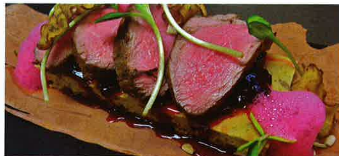
Rose Veal Tenderloin Sous Vide with Yellow Birch and Maple Sap, Sunchoke Quickbread & Beet Honey Jam.