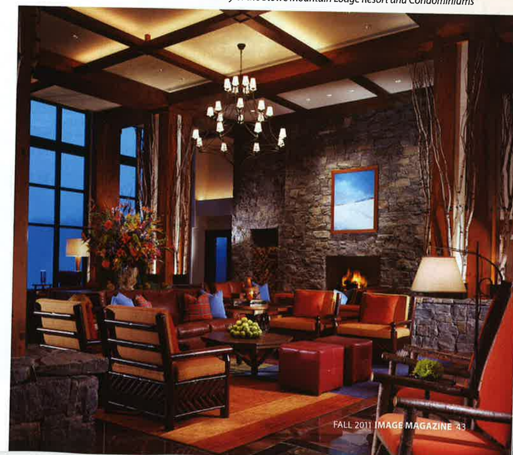
Lobby of the Stowe Mountain Lodge Resort and Condominiums

A gondola ride connecting Spruce Peak to Mt. Mansfield assures resort guests slopeside access to the most legendary ski terrain, challenging hiking and biking trails in the area and is the ideal setting to view fall foliage amidst Lake Champlain and the Adirondack mountains. Other amenities include a Bobb Cupp 18-hole championship mountain golf course, fly fishing, upscale boutique shopping, fine and casual dining, a 21,000 square foot spa and wellness center and state of the art performing arts center. The resorts specialty Alpine Concierge service tracks guests preferences before their stay to include: specialty foods stocked in the refrigerators and ski & golf valet services. Your home away from home, your wish is their every command at the world-class Stowe Mountain Resort and Condominiums. stowemountainlodge.com